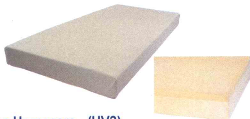
Hi-Visc Homecare - (HV3)

Community Vitality OUTPERFORMED 17 OTHER MATTRESSES in a comprehensive UK Ministry of Health's scientific evaluation of pressure relieving effectiveness, with its Pelvis's Peak Interface Pressure and also achieved 2 nd place with its Heel Peak Interface Pressure. For further details please visit the following link http://www.pasa.nhs.uk/pasa/Doc.aspx?Path=[MN][SP]/NHSprocurement/CEP/mattresses/MHRA%2003129-X.PDF (Page 9) Community Vitality consists of 1.5" visco and 3.5" orthodox foam.