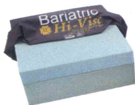
Hi-Visc Bariatric - (HV6 Bari)

Hi-Visc Homecare economy mattress consists of 1.5" visco and 3.5" orthodox foam.