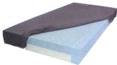
Hi-Visc - (HV4)

Visco-elastic pressure care replacement mattresses are made from an energy-absorbing, temperature sensitive material that responds to heat and moulds itself uniformly around the patient. Visco elastics work by conforming to the contours of the body shape reducing pressure to an absolute minimum. This allows patients to benefit from the maximum support and pressure protection possible during sleep or lengthy stays in bed, without the pressure or discomfort that is often associated with bed care. It has been clinically proven to minimise friction and shear and it is cost effective, numerous clinical studies has challenged the role in the Community of flat alternating air overlays/mattresses in favour of using visco-elastic products. The advantages: no maintenance, no alarms, no vibration, no cables, no noisy electronics. Uniquely designed cover, where zip opening is set inboard and underneath, ensures that the mattress is used in the correct way and minimises the risk of fluid ingress and contamination.