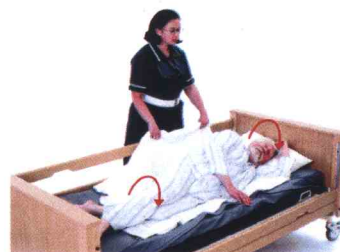
Hi-Visc + Turn.aido - (HVTO4)

It consists of 3" visco, 5" orthodox foam. Special sizes available on application.